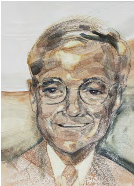
GEORGE HEARTWELL Mayor City of Grand Rapids