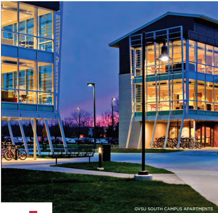
GVSU SOUTH CAMPUS APARTMENTS

SUSTAINABILITY. ADAPTABILITY. RELIABILITY. LIKABILITY. VIABILITY.