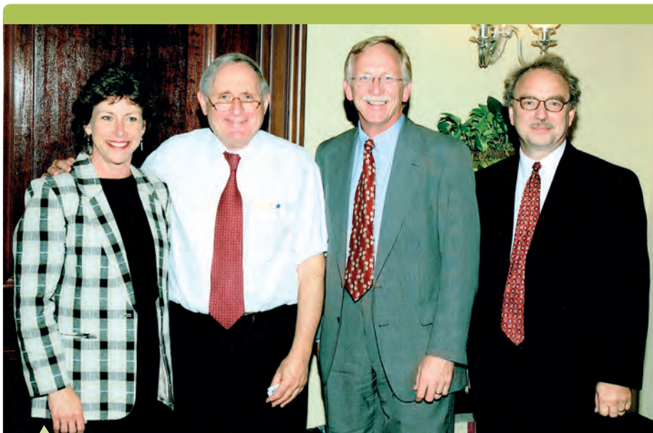
West Michigan Sustainable Business Forum provided a platform for business, government and environmental activists to collaborate on key issues.

A select group was taking it even further, experiencing personal revelations about the role of business in environmental and social concerns. Emboldened by a West Michigan culture that prioritizes natural resources and the well-being of employees and the community, pockets of very forward thinking emerged locally, parallel to national efforts by large environmental organizations to organize corporate partnerships.