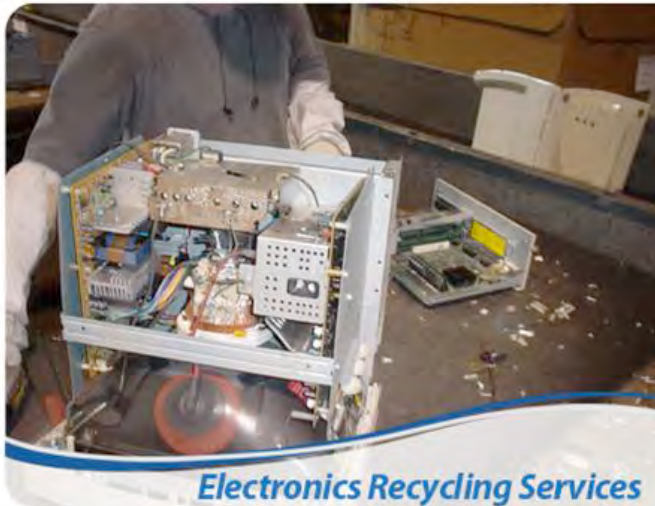
Electronics Recycling Services